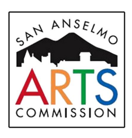
PaintBox Utility Box Public Art Project Phase 3: High School