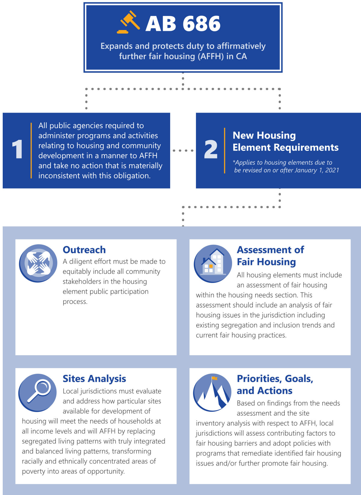
Chart 1: Summary of AB 686 Requirements